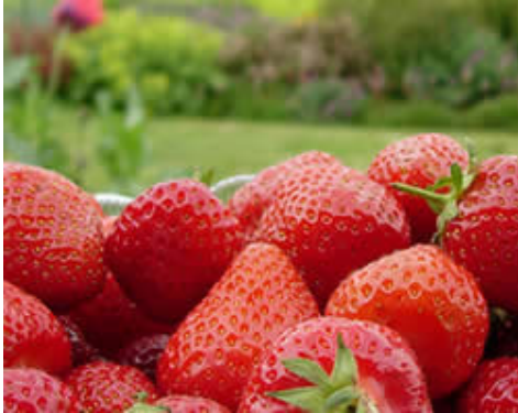
Delicious ripe strawberries